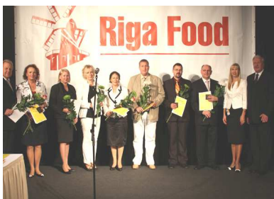
RĪGA FOOD (Picture No. 10.)