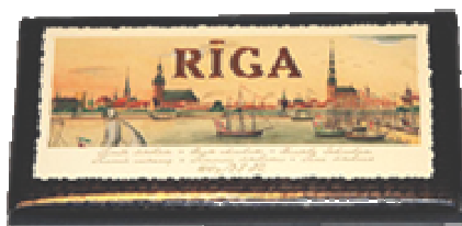
Picture No. 2. Chocolate Rīga is especially popular among tourists.

After 1990, in the years of independence, the usage of the name of the country in the names of commercial products and especially in the names of companies was restricted by instruction (Resolution No. 462, § 2.4 of the Council of Ministers of the Republic of Latvia, 04.11.1992) on purpose to protect oneself against belittling of the patriotic notion. Nevertheless there are such names in use – which are connected with luxury products, for instance: box of sweets Latvija , Rīga , chocolate Rīga , cheese Latvija , etc. (See Pictures No. 2, 3, 4.). One of the most favourite names in commercial products is Vecrīga ('Old Riga'): name of the cake Vecrīga , name of liqueur Vecrīga , etc. All these products are known with positive connotations. They are also meant to be enticing pieces of souvenirs.